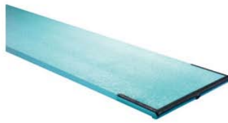
DURAFLEX 16 ft