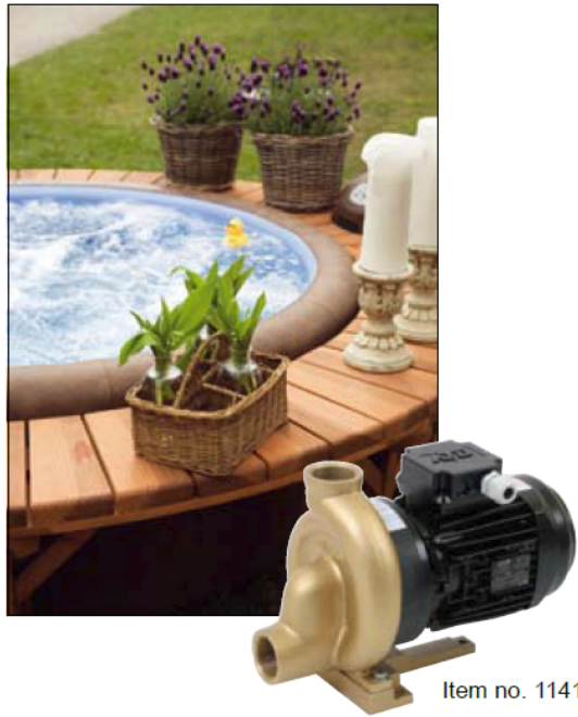
Item no. 11416