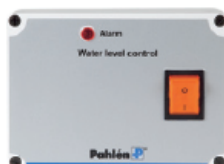
Item no. 11250

112505 Non leak flange for cable of level control.