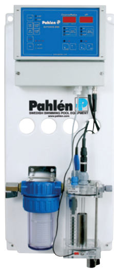
Item no. 4161402