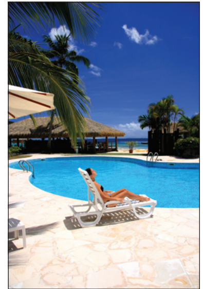
Item no. 4161408

Autodos 4000 has three measuring units and measures pH, free chlorine and redox.